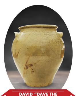
DAVID "DAVE THE POTTER" DRAKE