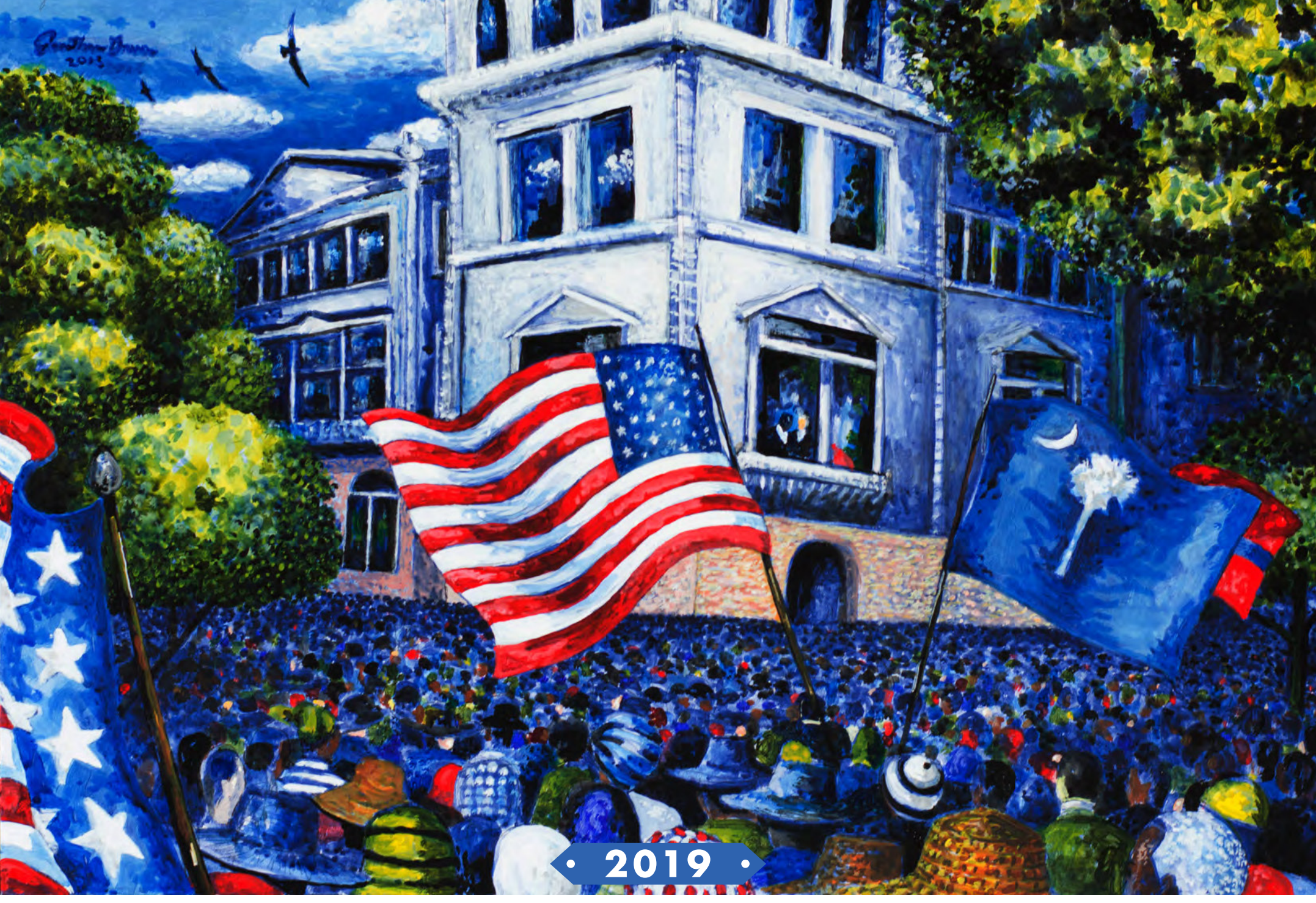
SOUTH CAROLINA AFRICAN AMERICAN HISTORY CALENDAR

PRESENTED BY THE SOUTH CAROLINA DEPARTMENT OF EDUCATION